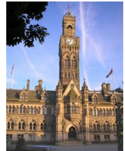
Bradford City Hall – a human feature