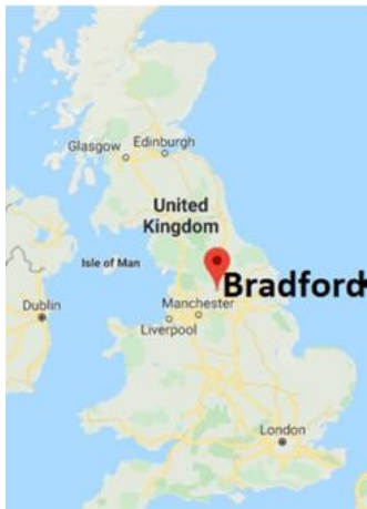
A map of Bradford within the United Kingdom.