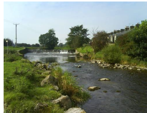
The River Air - a physical feature